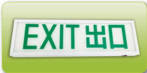
"CRYSTALITE" Cat. CX-LED-630-B