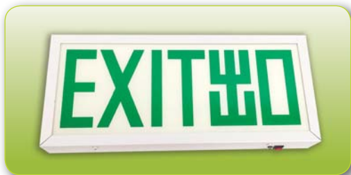
"CRYSTALITE" Cat. CX-LED-430-B

Surface mounted, self-contained, maintained type, super bright white LED exit sign box with automatic changeover device for 3 hours emergency battery discharge.